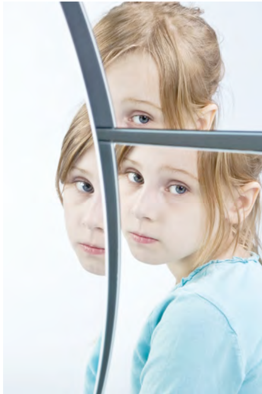
Aura Rosenberg, Skuta Helgason/Theodora , 2008, C-print, 40 x 30". From the series "Who Am I? What Am I? Where Am I?," 1996–2009.