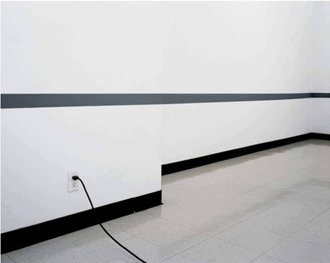
Luke Stettner , Continuous and Discontinuous Lines , 2006, 50 x 50 inches, mounted, c-print photograph.

In experiments that didn't work out as well as I might have hoped, I took a few pictures of the show with my new phone. The camera isn't all that great, but it does a reasonable job at communicating why I think it's worth it to go out to the West Village and take a look at the exhibition. A few highlights below.