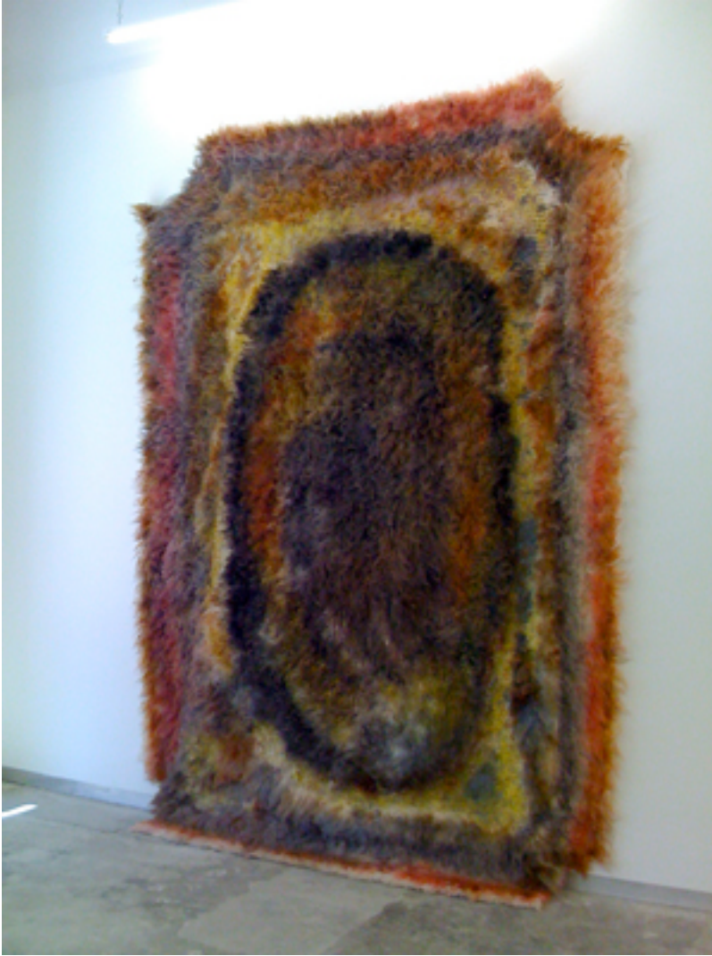
Anna Betzebe , Untitled , 2008, Wool, pigment, acid dyes, 125 x 92 inches

Betzebe's giant wool hanging inspired by old timey portrait frames and mirrors at first glance may seem a little hippy or sentimental, but it's a little too large and abstract to maintain those connotations for any length of time. The more you look at this piece the better it gets.